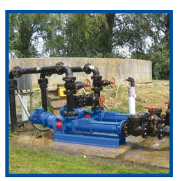
Transfer pumps at a WWTW's pumping sludge