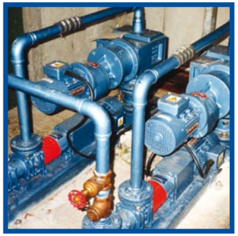
Packaged pumping system transferring raw sewage