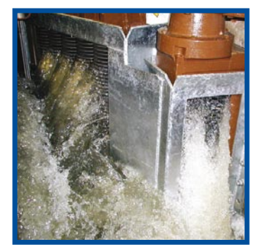
Discreen and Muncher screening and macerating waste water